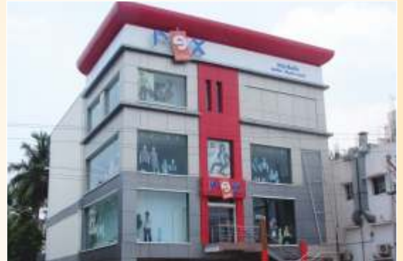
Jayam Mall - Tambaram