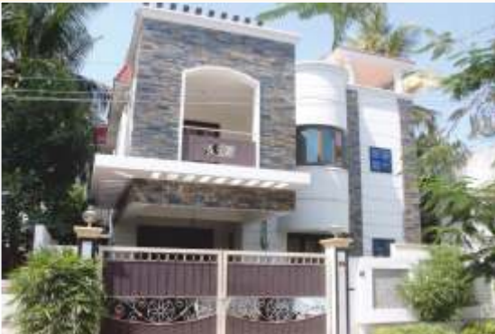
Santhanam - Palavakkam