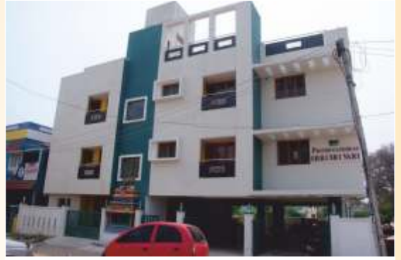
Shri Srivari - Porur