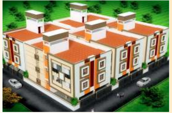
Dayal Villa - Kelambakkam