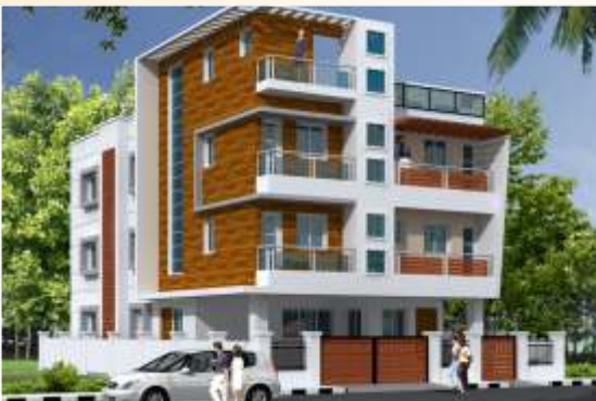
Hema Narasimhan - Thiruvanmiyur