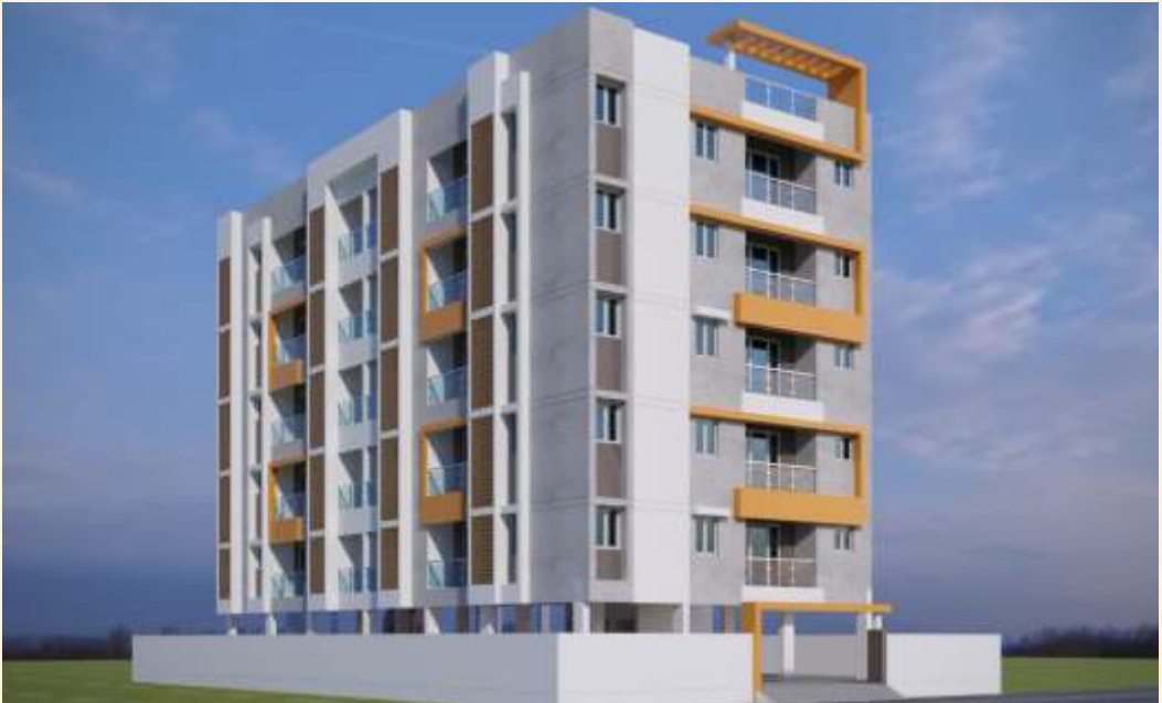
Prathyumnan - Kelambakkam