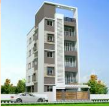
Shri Krish - Mount Road