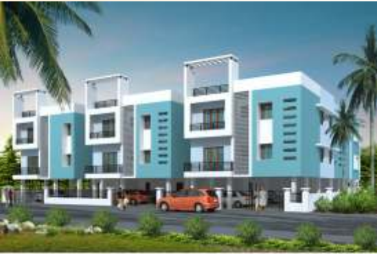
Anirudh - Kelambakkam