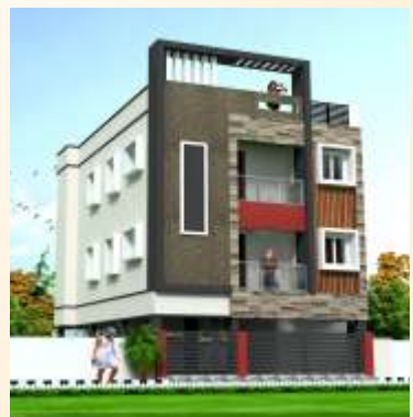
Shyam - Sholinganallur