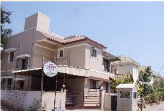
HPDCL - Perungudi