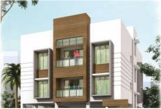
Asif (USA) - Vadapalani