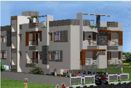
Viswakarma - Kelambakkam