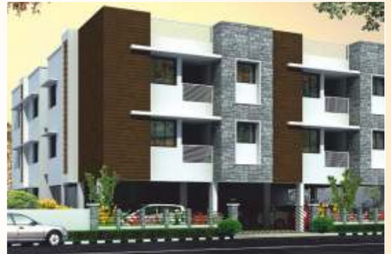
Aathidhyaa - Kelambakkam