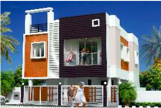
Mohanraj - Valasarawakkam