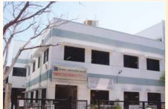
Perfect Electronics - Perungudi