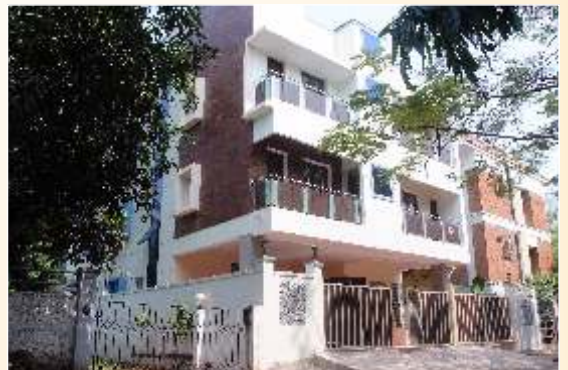
Hema Narasimhan - Thiruvanmiyur