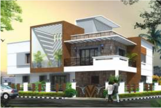
Sudhakar - Thiruverkadu