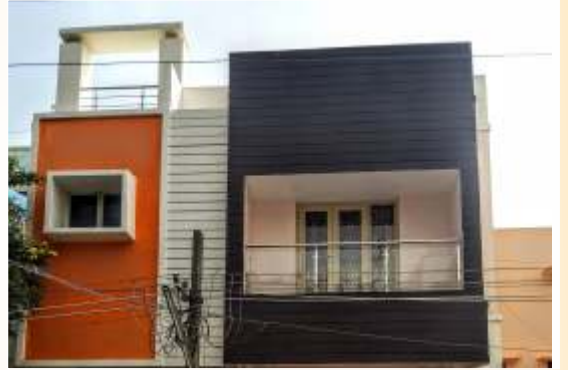
Mohanraj - Valasarawakkam