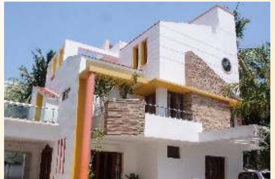
Jayakrishnan - Sholinganallur