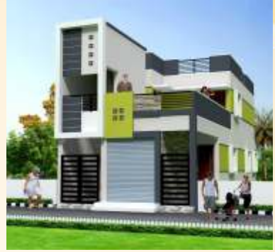
Ramesh - Kelambakkam