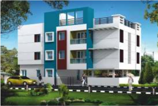
Shri Srivari - Porur